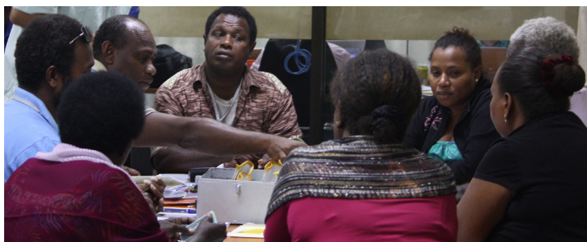
UNCDF tests a simple breaking system in the Solomon Islands during a workshop

What are the practical implications of the balance-or-break trade-off? Governments and central banks want to expand financial inclusion. They also want to see poor citizens, many of whom are illiterate, protected from loss of savings and other financial abuses. These priorities encourage a liberal approach to regulation: minimizing administrative burdens placed on savings groups, and channeling protection measures through features of savings group design, and practitioner capabilities.